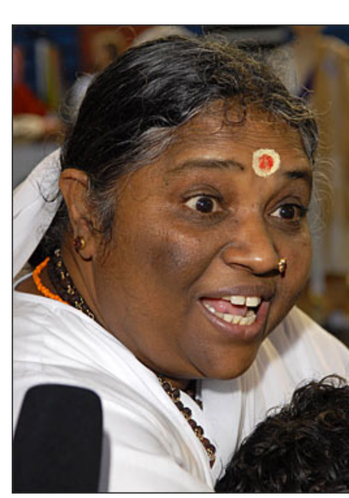
Unconditional love... she's embraced 25 million people

Her infamous clinches are said to spread peace and harmony through her unconditional love.