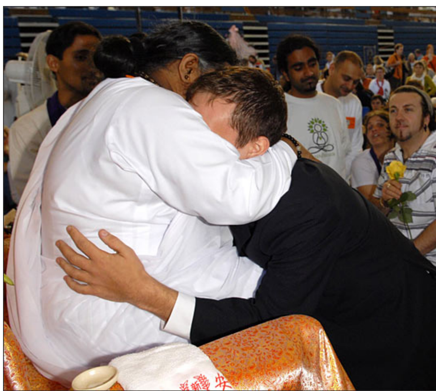
Hold tight ... spiritual superstar Amma cuddles Sun man